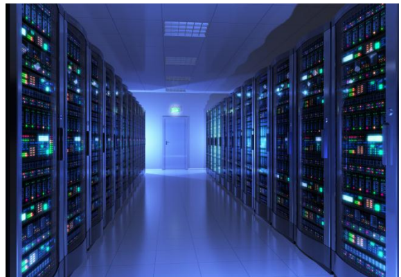
Powered by Pluribus Networks

OneAsia has deployed the Pluribus Networks F64 Server Switch, the state-of-the-art software-defined networking solution (“SDN”) in its enterprise-class data centers in Hong Kong and Shanghai, China. The innovative SDN solution is supported by the PN Technology (Asia) Limited, a reseller of Pluribus Networks in Greater China. Being the first data centre to deploy SDN solution in Asia, the new solution allows us to have more control over network traffic flow and shorten the respond time for changing business requirements. The SDN is an approach to networking in which control is decoupled from hardware and given to a software approach.