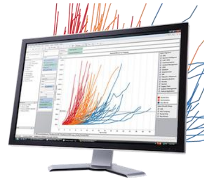
Tableau Software has recently launched its latest version of its business intelligence, Tableau 8.1 software. The new feature of Tableau intelligent tool allows users to deliver faster analyses, higher degree of virtualisation and rapid-fire business intelligence on data of any size or format.

The new features of Tableau software include: